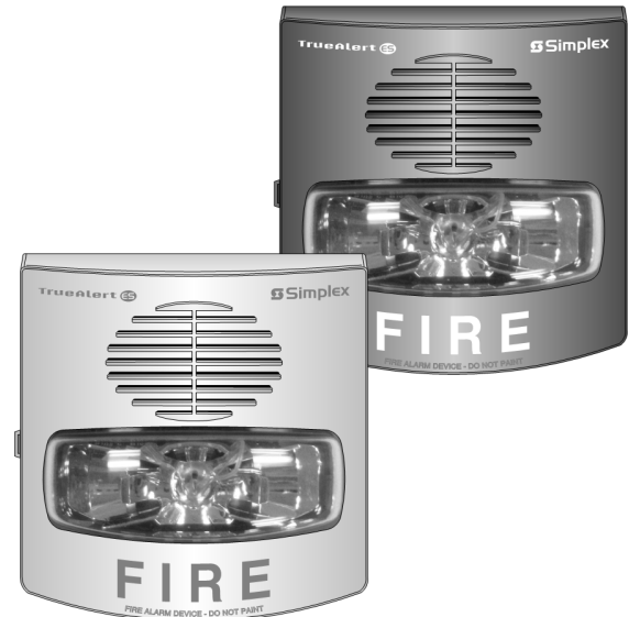
TrueAlert ES Addressable A/Vs are Available in Red with White Lettering and White with Red Lettering