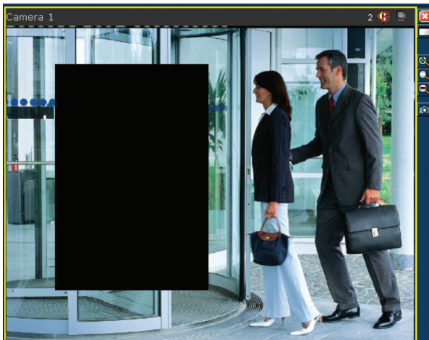
Area masked by Privacy Zones feature