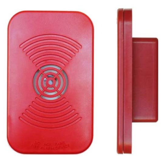
Red Mini-Horn, Front and Side View

Canadian two-stage alarm applications. A second switch position allows the SmartSync March Time pattern input to be selected as either 60 BPM or 20 BPM. 20 BPM is typically required for Canadian two-stage alarm applications as the pre-signal, followed by the Temporal Pattern. Two-stage alarm operation requires a 4007ES, 4010, 4010ES, 4100ES, or 4100U as the control panel.